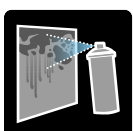
DIRECT TO RUST