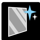
GLOSSY FINISH SURFACE