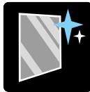
GLOSSY FINISH SURFACE