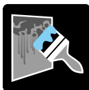
DIRECT TO RUST