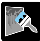
DIRECT TO RUST