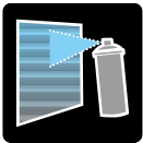
EASY TO SPRAY