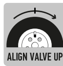
ALIGN VALVE UP

Tyre Foam is sealer for repairing and inflating instantly, used for cars, trucks, busses, motorcycles and bicycles. A rubber latex based aerosol product that re-inflates punctured tyres and at the same time seals the puncture. No need to dismount the wheel or every kind of tyre - with or without tube. It acts deeply into the tyre forming a sealing film which ensures an efficacious repair. Tyre Foam is designed to give fast, temporary relief in emergency situations when changing a wheel with a flat tyre is inconvenient or even dangerous.