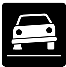
FLAT TYRE FIX