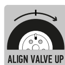
ALIGN VALVE UP

Tyre Foam is sealer for repairing and inflating instantly, used for cars, trucks, busses, motorcycles and bicycles. A rubber latex based aerosol product that re-inflates punctured tyres and at the same time seals the puncture. No need to dismount the wheel or every kind of tyre - with or without tube. It acts deeply into the tyre forming a sealing film which ensures an efficacious repair. Tyre Foam is designed to give fast, temporary relief in emergency situations when changing a wheel with a flat tyre is inconvenient or even dangerous.