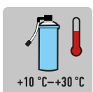
WORKING TEMPERATURES +10 °C – +30 °C