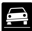
FLAT TYRE FIX