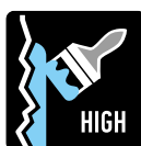
HIGH FILLIG POWER