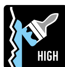
HIGH FILLIG POWER

Maston stonechip coating is synthetic and rubber resin based underbody coating for long-term gravel protection of front and rear spoilers, sills, side skirts, wheel arches, etc. Also suitable as a protector during storage of machines and metal parts. Penetrates into the smallest gaps, removing moisture and protecting against rust. Do not coat the exhaust, brake systems, or motor parts.