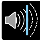
SOUND ABSORB- ING