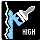
HIGH FILLIG POWER