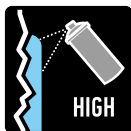
HIGH FILLIG POWER