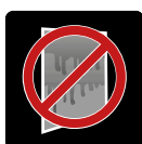
NO RUN DOWN SURFACE