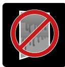
NO RUN DOWN SURFACE