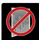
NO RUN DOWN SURFACE