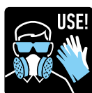
USE! SAFETY GEAR